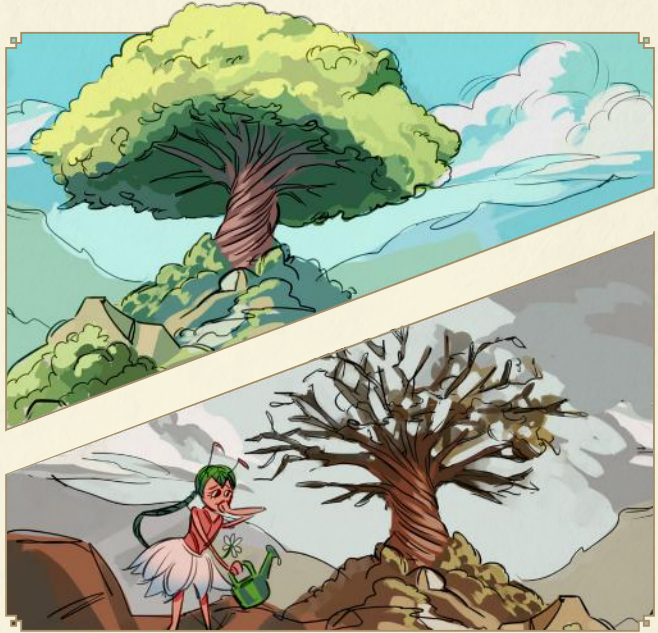
Above: The vibrant Tree of Life in better times.

Sadly, without any Rescuers in sight, it seems like Vanam will end up as a paradise lost to Bugkind forever.